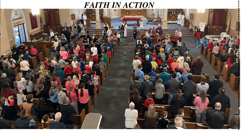
Pews filled during Ash Wednesday morning Mass! "Remember that you are dust, and to dust you shall return."